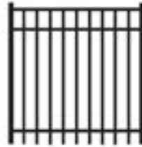
Straight Flat Top Walk Gate

Complete your aluminum fence project with a walk gate to match your fence. Our standard walk gates come in a straight style or you can choose to upgrade to a more decorative arched design. All gates are fully welded giving a clean, smooth appearance and include self-closing hinges.