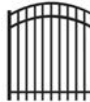
Arched Flat Top Walk Gate*

* Arched walk gates are an upgraded option.