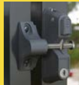
Locking Latch with Key Access

All of our vinyl fencing is backed by a transferable limited lifetime warranty.