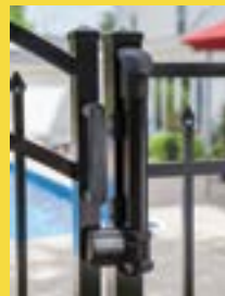
Locking Pool Latch

* Latches need to be purchased separately.