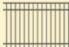
Flat Top 3-Rail 4' Tall