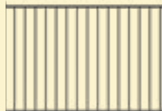
Flat Top 2-Rail 4' Tall